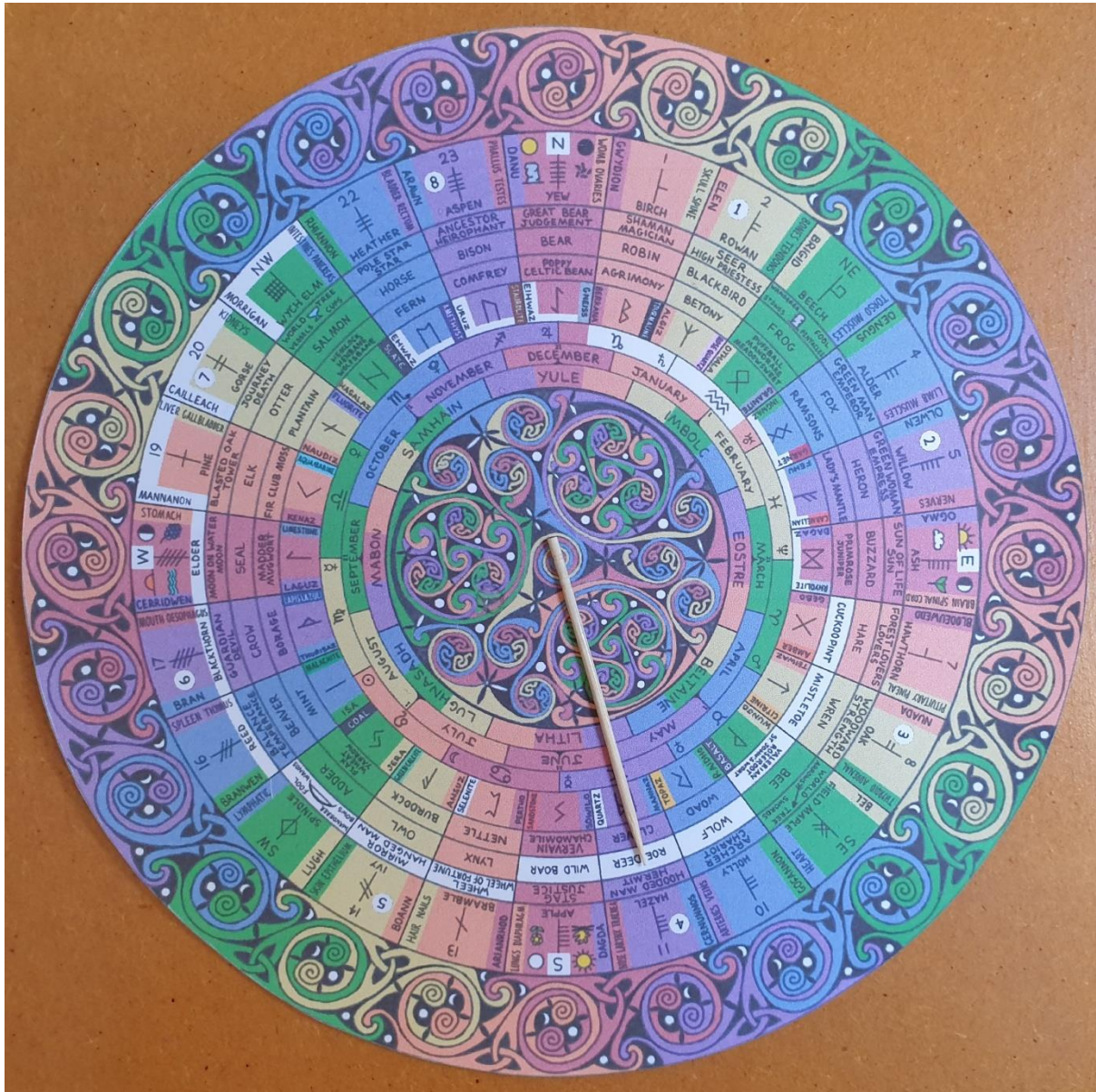
Photo 2. The First Turn of the Wheel Falls in Segment 11, choosing the Animal Nature Realm