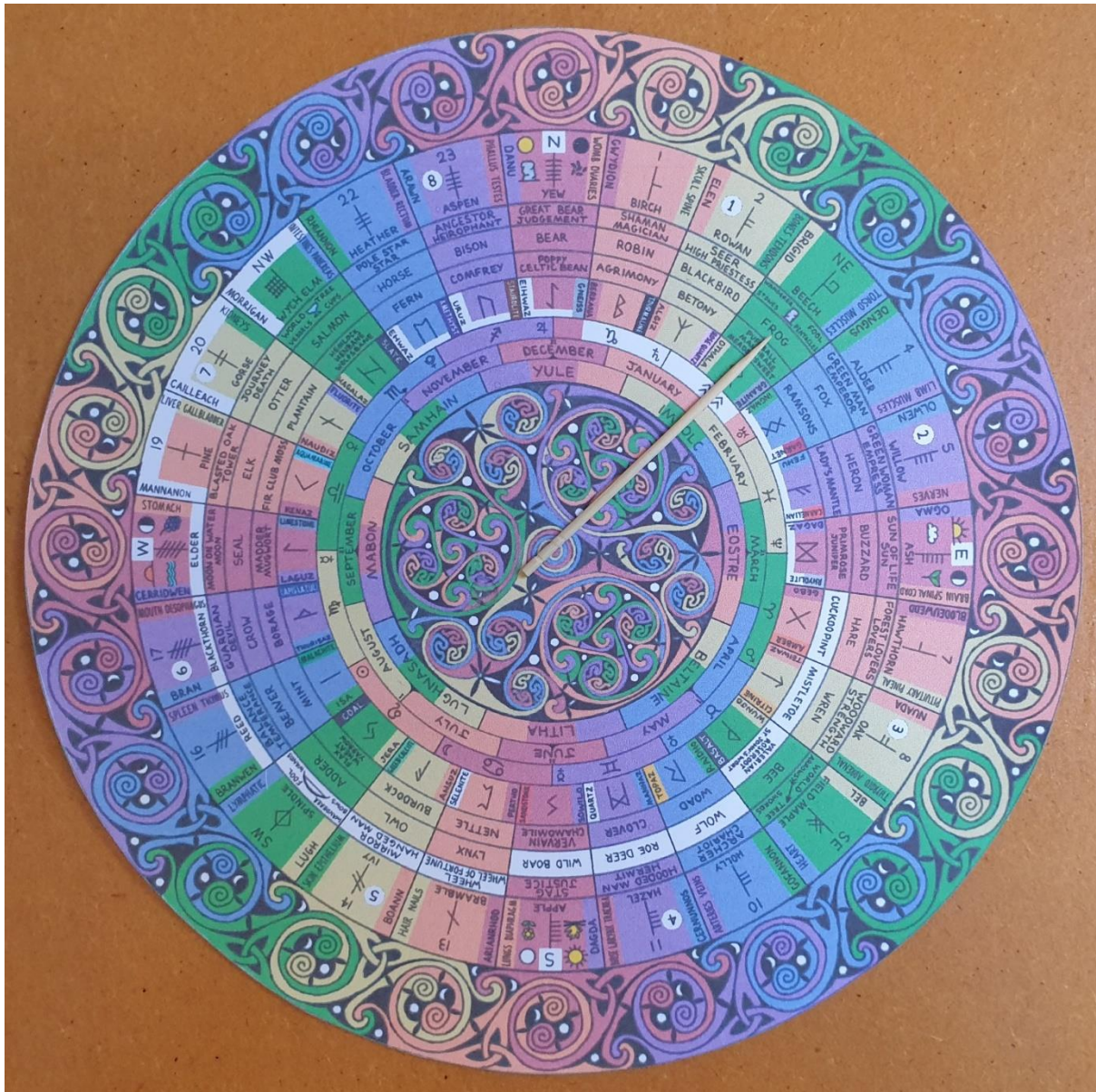
Photo 3. The Second turn of the Wheel Falls in Segment 3, choosing the Frog